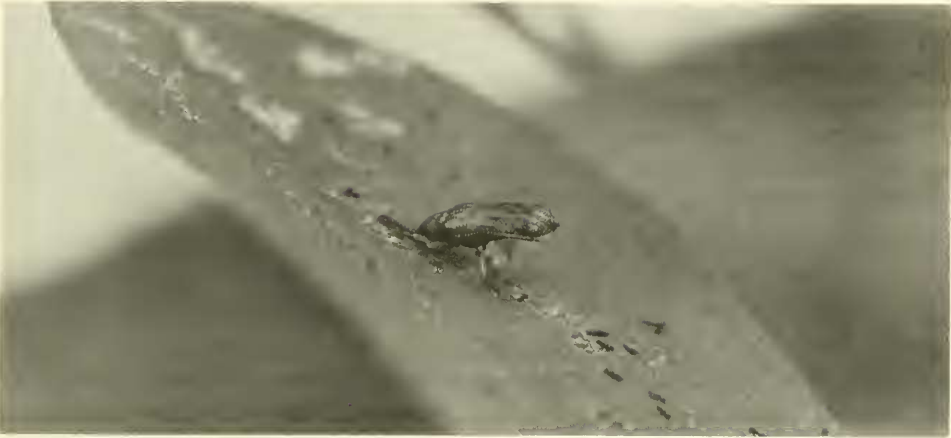
Fig. 1. Typical feeding posture of Sumitrosis rosea on black locust leaflets.

With the pair facing in the same direction, he quickly attempted intromission. In one pair, we observed a violent antennal quivering in both sexes, with the male mounted on the female prior to intromission. Antennal quivering may be part of the female's acceptance behavior. Pairs often remained in copula for 1–4 hours, with the abdomen of the female sometimes elevated. Males usually remained atop the female after copulation. She was observed to dislodge the male by a side-to-side wriggling, a behavior displayed by locust leafminer females. In S. rosea , multiple matings were frequent, with one pair mating seven times in nine days. Mating in O. dorsalis also is characterized by an absence of prolonged courtship. This species exhibits rapid pair formation with the male often inserting his aedeagus within 30 seconds, long copulations followed by postcopulatory "escort" behavior, and multiple matings (Fritz, 1983; Kirkendall, 1984).